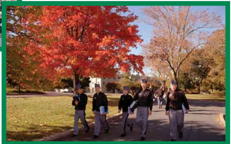
Cadets head for class around the Middle School Circle.