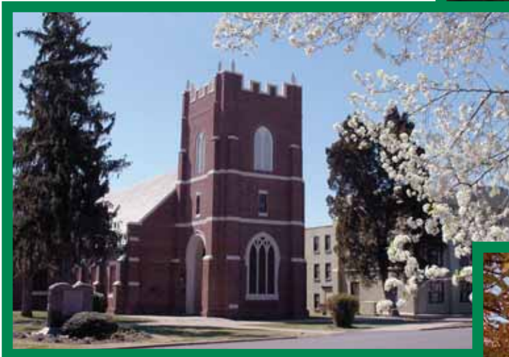
Wicker Chapel is at the heart of the campus.