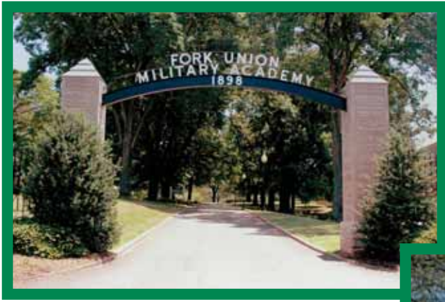
The main entrance to campus is located on US Route 15.