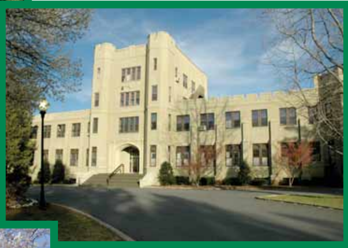
Hatcher Hall, built in 1916, is where you'll find our Admissions Office and other administration and business offices.