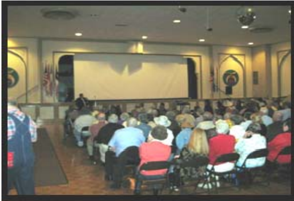
Deputy Grand Master speaking to the participants at the hoedown held at Acca Shrine Center.