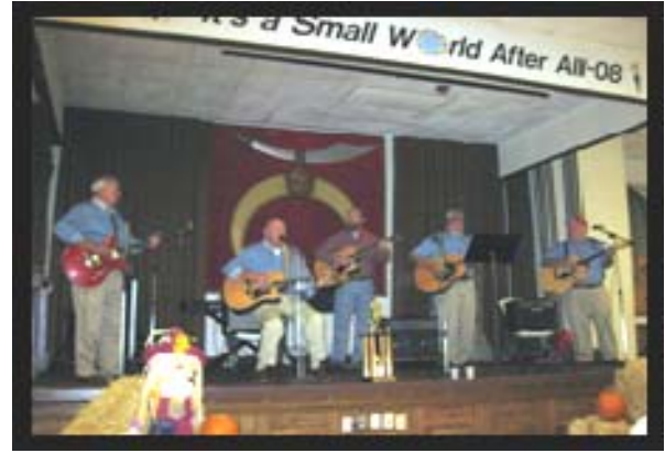
The country band which played for the hoedown breakfast at Khedive Shrine Center.