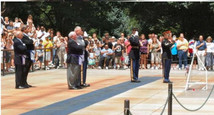
Paying respect to the Unknown Soldier during the playing of Taps after the laying of the wreath.