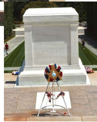
The wreath in front of the Tomb of the Unknown Soldier.